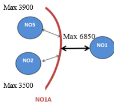
FIGURE 2 PRINCIPLE SKETCH OF THE NO1A CONCEPT

As of January 2015, the optimization principle of special constraint limitation is introduced in the day-ahead price algorithm for the combination of NO2-NO1 and NO5-NO1. The additional constraint between NO5/NO2 and NO1 is referred to as NO1A, where the “A”